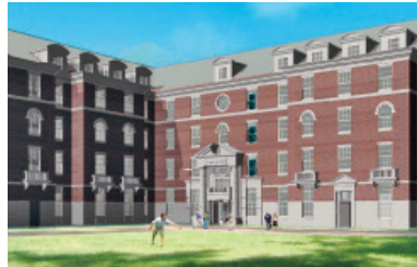
Kathy Crow Commons

The model supports a strong residential community, one enabling students to make friends more easily, transition more smoothly to campus life, enhance personal exploration and growth and benefit from new leadership opportunities. The model also promotes a sense of identity and belonging. Each Commons will develop traditions and host gatherings and activities to create a sense of community among residents.